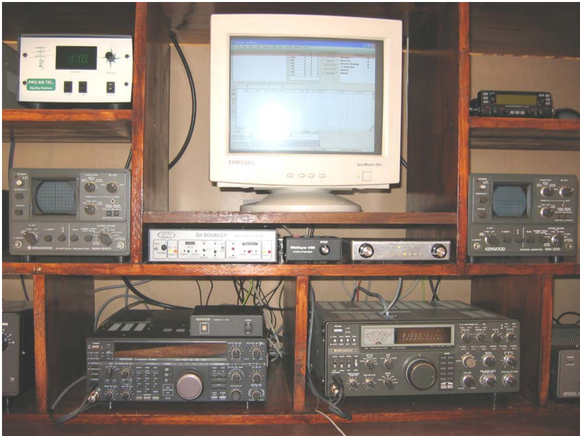
Figure 1 - The SO2R Operating Position at ZS6AA

Andrew Roos, ZS6AA andrew.roos@mweb.co.za June 2007